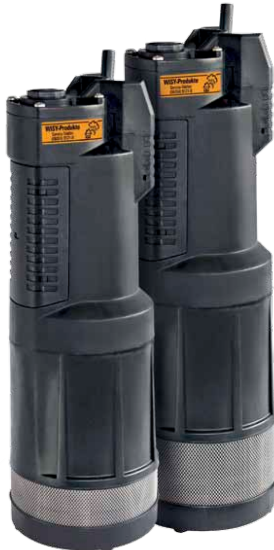
Beta 1000 / 1200 submersible pumps with direct suction inlet.

The 1200 model has alternative inlet fittings for the connection of fixed or floating suction filters in larger tanks.