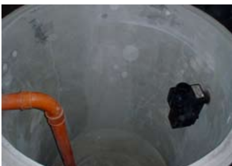
Interior view showing calmed inlet and trapped overflow

Each Oasis tank is supplied with a cover slab with either 600 x 600 or 600 x 750mm access opening. Tanks up to 2575 litres can be supplied with calmed inlet and trapped overflow pre-fitted; with larger tanks these must be fitted on site. Single tanks are supplied with 3 no. holes with seals suitable for standard 110mm pipe (or larger if required). The overflow invert level must be stated when ordering. All pipework orientations can be made to suit individual site applications and additional outlets can be fitted upon request.