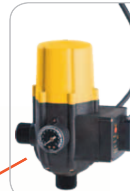
Wisys ® Zeta 02 advanced technology dedicated pump controller