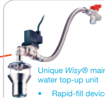
Unique Wisys ® mains water top-up unit