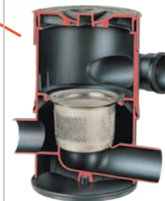
Wisys ® Vortex Fine Filter (WFF) The Original and Unique Vortex filter.