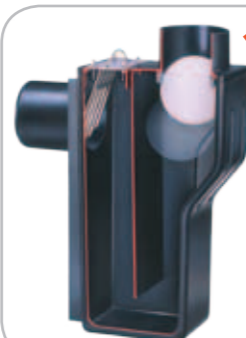
Unique Wisys ® Multisiphon overflow unit