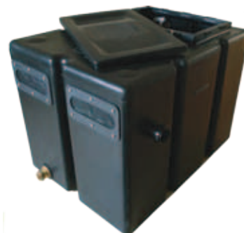
Specially adapted RainSava header tank as used in our Gravity system.

Beta automatic submersible pump as used in our Classic and Garden systems.