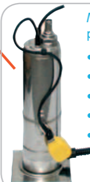
Multigo submersible multi-stage pressure pump