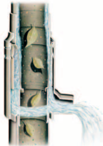
The Wisy RS Filter Collector showing its unique operating technique.