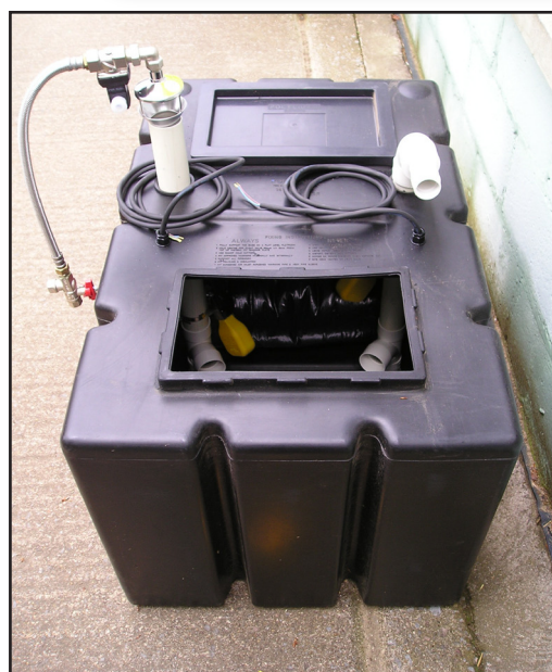
View of pre-fitted break tank showing the top-up assembly & the calmed inlets and float switches.